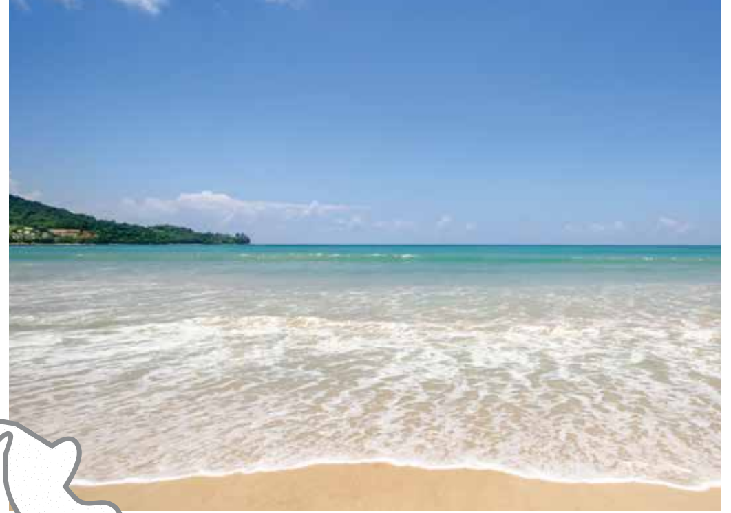
Computer generated image for advertising purpose only