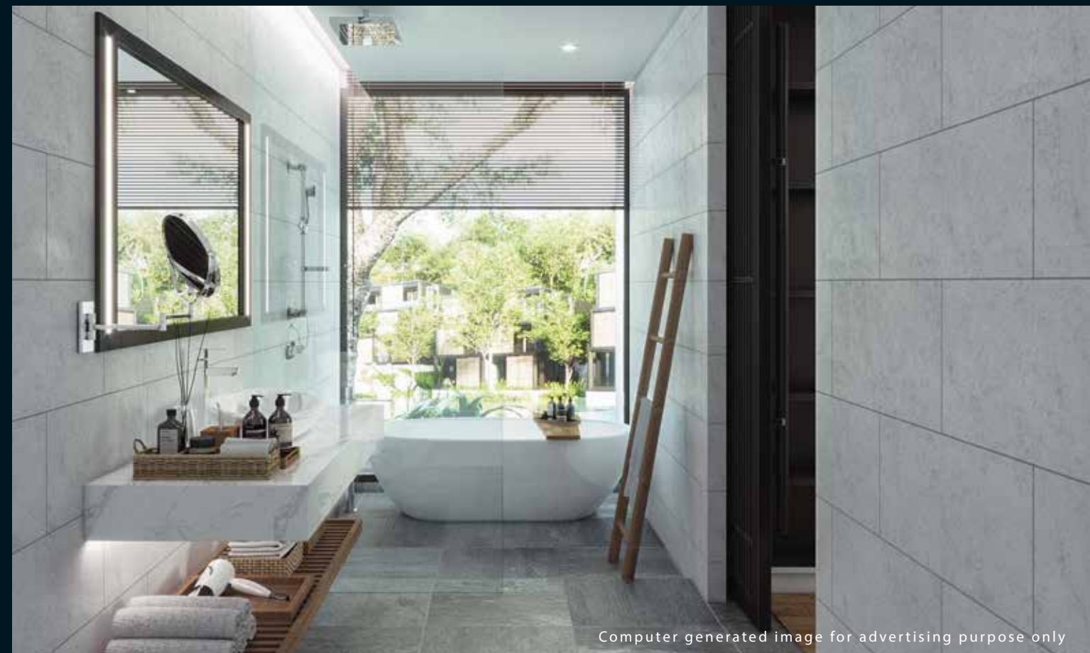
Computer generated image for advertising purpose only