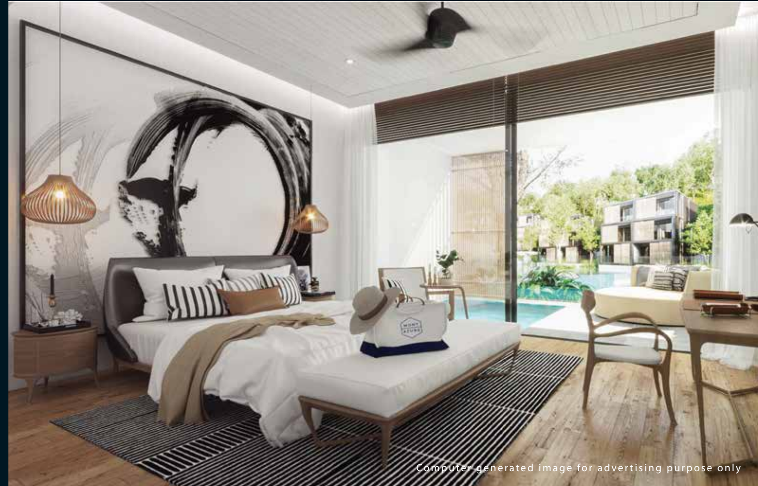
Computer generated image for advertising purpose only

From an investor’s perspective, the security offered when purchasing resort residences backed by proven developers and an international operator has become a major differentiator. Combined with factors such as well-known architects and designers, a prime location within an evolving community and an established destination provides a solid foundation for attractive yields and capital appreciation.