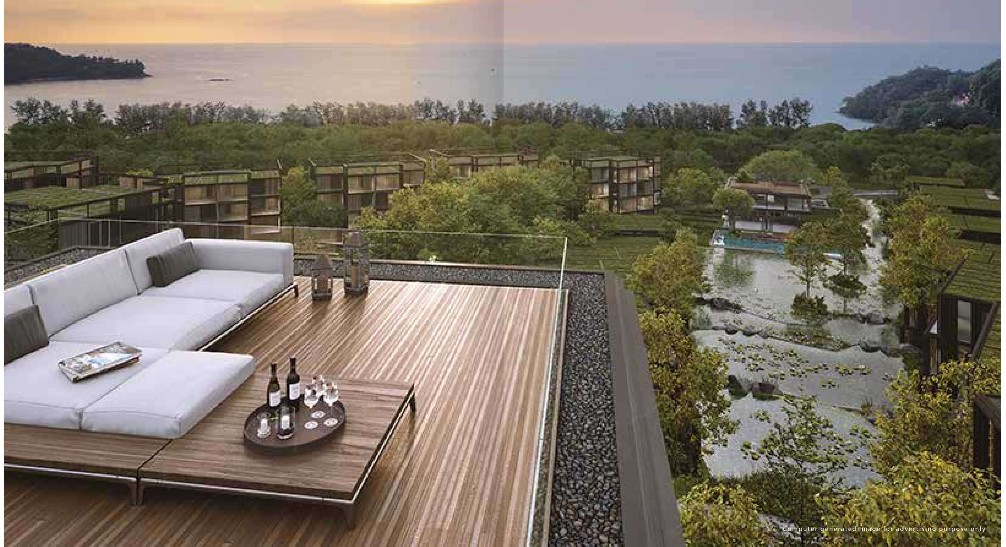
Computer generated image for advertising purpose only